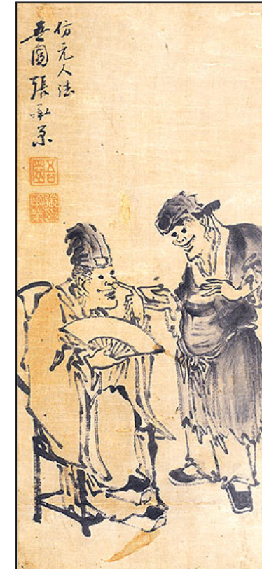
"Jeon (telling a story)" by Owon (Jang Seungeop 1843~1897)