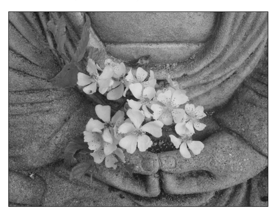
"Help Heal the World"